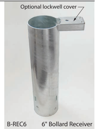
B-REC6 6" Bollard Receiver