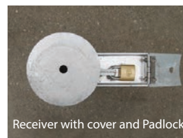
Receiver with cover and Padlock